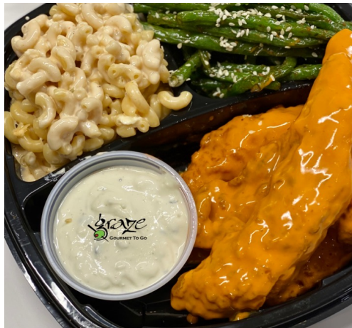
Chicken Lip Extravaganza for One