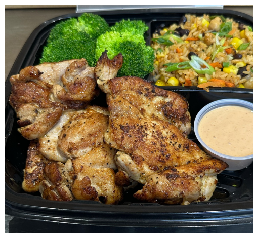
Grilled Chicken Dinner for One