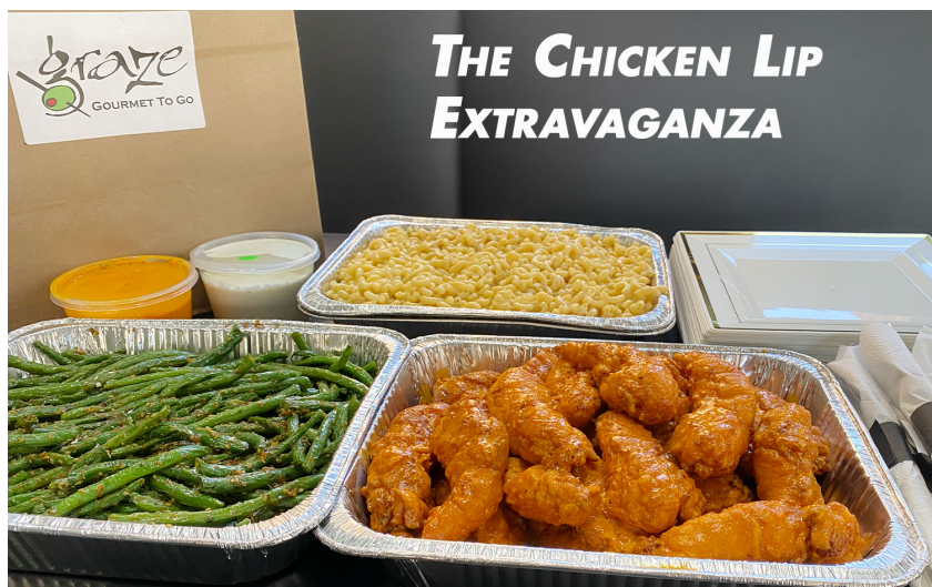
The Chicken Lip Extravaganza