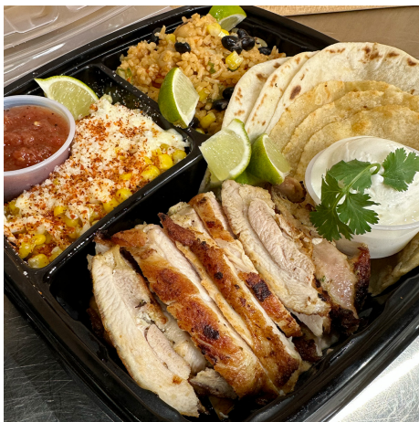
The Taco Fiesta for One