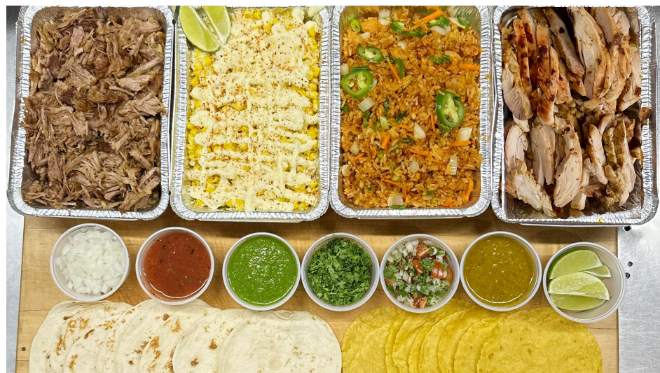
The Street Taco Fiesta