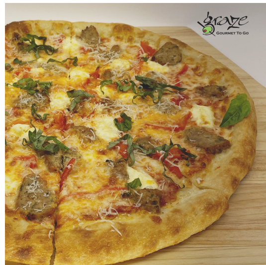
16" New York Style Pizza